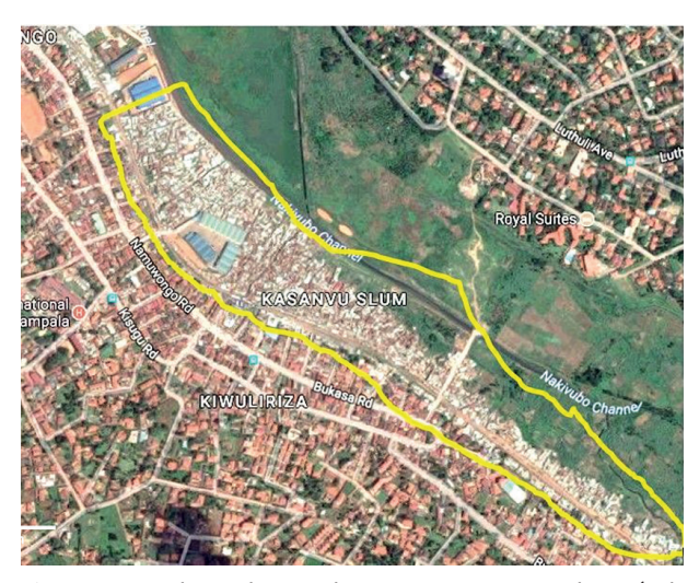
Figure 1. Google Earth map showing Namuwongo slums (yellow curve-out) and nearby industries and residencies

We conducted a cross-sectional comparative study, in which quantitative data were abstracted from the National HIV Counselling and Testing Registers stored at Kisugu HC III.